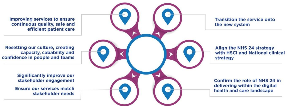
Diagram 1: NHS 24 Key Objectives, 'Making it Happen – Our Key Priorities.